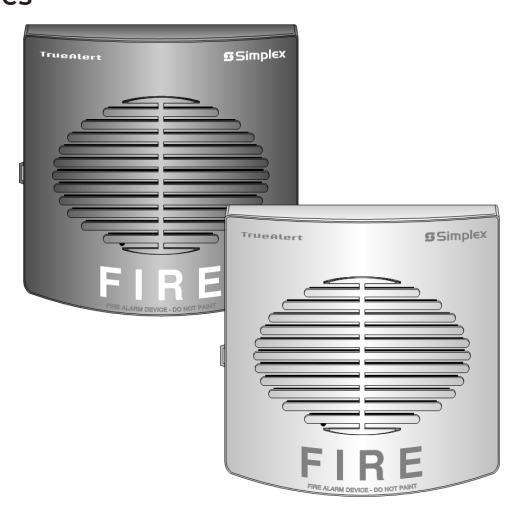
Figure 1: TrueAlert Multi-Tone Horns are Available in White with Red Lettering or Red with White Lettering