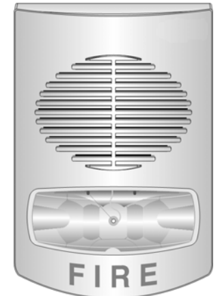
Figure 1: S/V Appliances are available in red with white lettering and white with red lettering