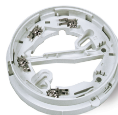
Figure 11: 4B Base

4098-5260 4 in. Continuity Base provides the features of a Standard Mounting Base and allows for internal short circuit isolation in the sensors to protect them from electrical shorts on the SLC.