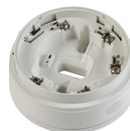
Figure 13: 4098-5217 Loop Powered Sounder Base

Select one of four sounder output levels by programming from the host fire alarm control panel with MX Loop Module: