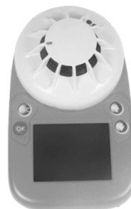
Figure 5: MX 850 EMT Programming Tool

Using the 850 EMT Programming Tool you can also change addresses stored in a sensor or other addressable device's non-volatile memory, which makes addressing errors easy to rectify.