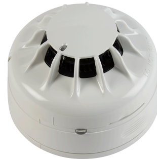
Figure 3: Photo Sensor with Loop power Sounder Base