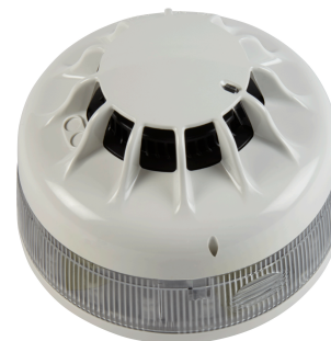
Figure 4: Photo Sensor with Loop power Sounder Beacon Base