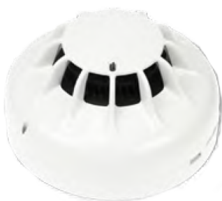
Figure 9: 4098-5268 Triple Sensor

Note: The 4098-5265 additionally includes a built in isolator.