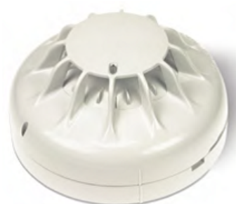
Figure 6: 4098-5267, 4098-5257 Heat Sensors

4098-5267 4098-5257 Heat Sensors return analog temperature readings to the fire alarm control unit for evaluation. Construction includes a high quality thermistor with very low thermal mass so the sensor can provide fast and accurate temperature readings for heat detection determination.