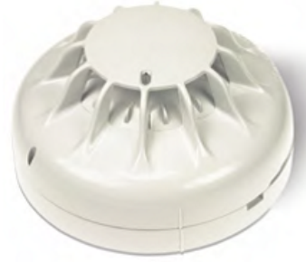
Figure 1: Heat detector

Detection modes. MX Sensors communicate to the MX Loop Module using MX Technology communications. Each detector can operate in one of several detection modes, thus it is easily optimized to the risk.