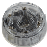
Figure 14: 4098-5220 Loop Powered Sounder Beacon Base

Sounder bases require a separate address; with sensor, 2 addresses are required for each sounder base with sensor