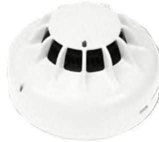
Figure 2: Photo, Photo-Heat, or Photo-Heat-CO