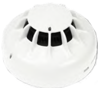
Figure 8: 4098-5265, 4098-5255 Photoelectric Sensors with Heat Sensing

4098-5255, 4098-5265 Multi-Sensor provides the feature of the photoelectric sensor with the addition of heat sensor so the multi-sensor can satisfy the detection application with multiple risks.