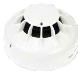
Figure 7: 4098-5266, 4098-5256 Photoelectric Sensors

Note: The 4098-5267 additionally includes a built in isolator.