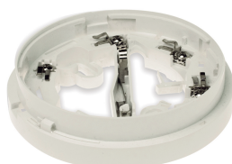
Figure 10: 4098-5260 4 in. Continuity Base

4098-5268 Triple Sensor with Isolator incorporates optical and heat sensors, combined with a CO sensor. The Triple Sensor uses powerful algorithms for use in life safety applications, and those where environmental conditions present challenges to standard sensors. It is a multi-sensor device which monitors smoke, heat and CO levels simultaneously to accurately determine the presence of fire. This sensor includes a built-in isolator.