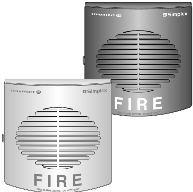
Figure 1: TrueAlert ES Addressable Chime covers are available in red and white with a variety of lettering for applications

This product has been approved by the California State Fire Marshal (CSFM) pursuant to Section 13144.1 of the California Health and Safety Code. See CSFM Listing 7135-0026:0334 for allowable values and/or conditions concerning material presented in this document. Additional listings may be applicable; contact your local Simplex product supplier for the latest status.