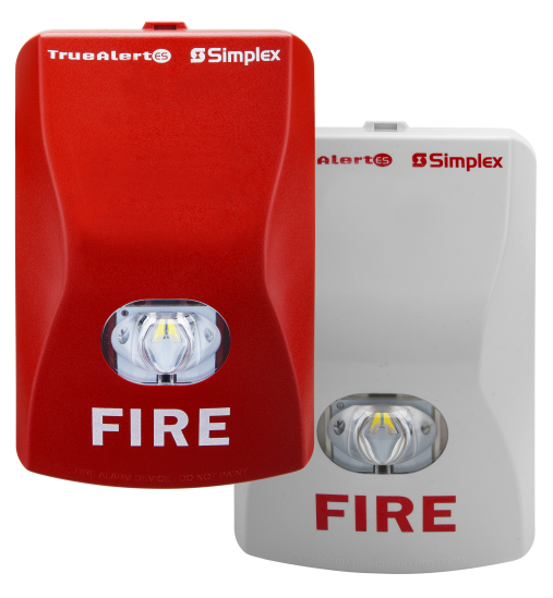
Figure 1: TrueAlert ES 59VO Series LED Addressable Strobes are Available in Red with White Lettering and White with Red Lettering